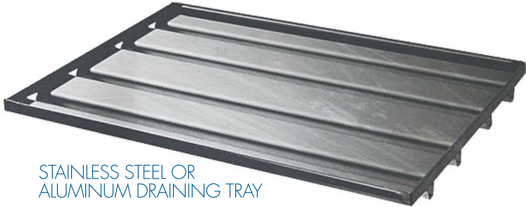
STAINLESS STEEL OR ALUMINUM DRAINING TRAY