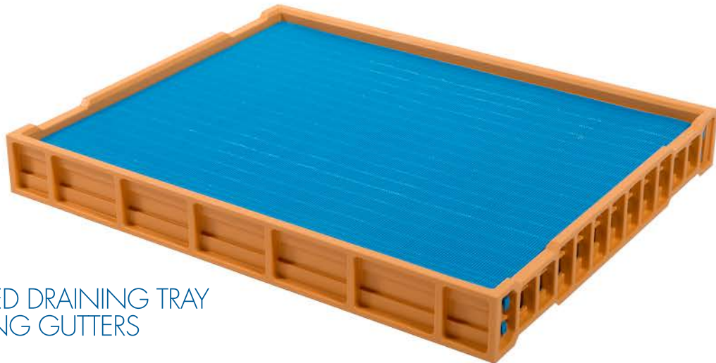
DOUBLE SIDED DRAINING TRAY WITH SLOPING GUTTERS